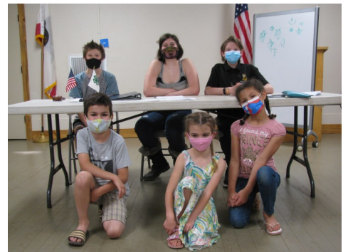
4-H members at the May 5 meeting