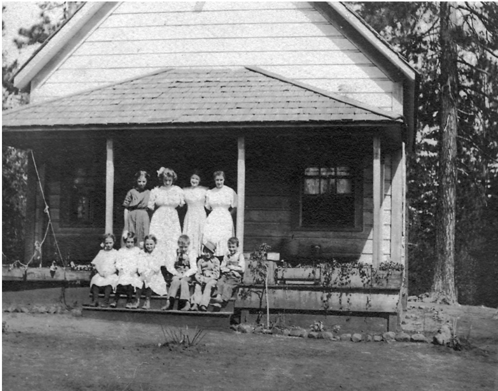
Grafton School, circa 1910

Cohasset's first elementary school, known as North Point, was built on Lower Vilas Road and the school district was formed in 1878. Ten years later a second school, Grafton, was established near the junction of Cohasset and Mud Creek roads. Located at a lower elevation, North Point was used as the "winter" school and Grafton served as the "summer" school for Cohasset students.